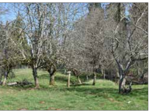
Excellent privacy on the back of the development