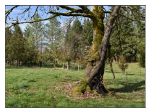
Property adjoins a private greenbelt

www.nwhomebuildergroup.com/commerce-meadows-subdivision