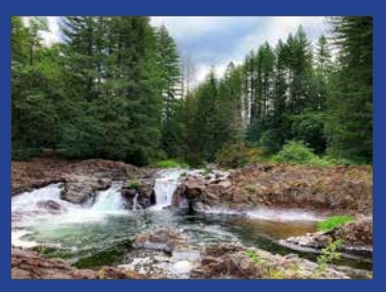
Lucia Falls Regional Park

Commerce Meadows is a new residential community primed for new construction homes. Only five lots are available and they all adjoin a private greenbelt. Located on the east side of Battle Ground, this neighborhood is only minutes from Battle Ground Village, a charming shopping center with excellent dining options, a coffee shop, professional services and more.