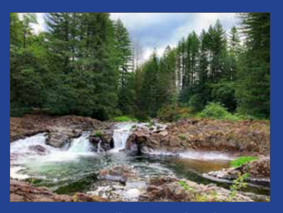
Lucia Falls Regional Park

Commerce Meadows is a new residential community primed for new construction homes. Only five lots are available and they all adjoin a private greenbelt. Located on the east side of Battle Ground, this neighborhood is only minutes from Battle Ground Village, a charming shopping center with excellent dining options, a coffee shop, professional services and more.