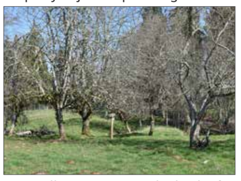
Excellent privacy on the back of the development