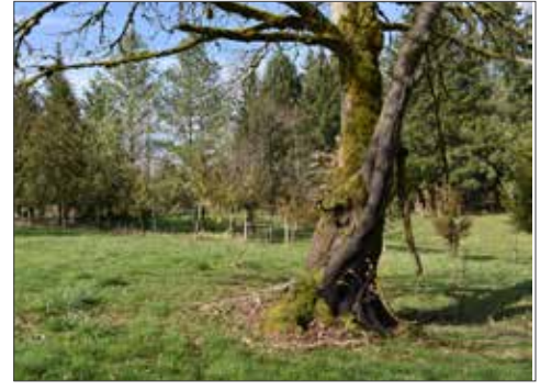
Property adjoins a private greenbelt

www.nwhomebuildergroup.com/commerce-meadows-subdivision