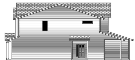
RIGHT SIDE ELEVATION SCALE 1/8"=1'-0"