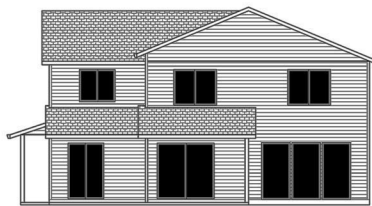
REAR ELEVATION SCALE 1/8"=1'-0"