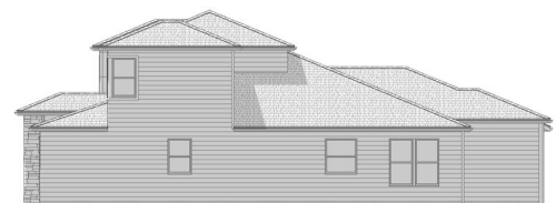
E4 Right Elevation Scale: 1/8" = 1'-0"